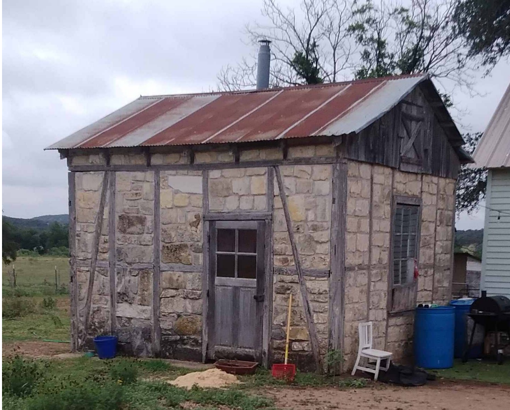
Lamm House, Kendall County, Texas

For more of Joseph Lamm's story, go to HJLamm1870.com . You can find the above-mentioned photograph of the reverse side of the house on The Portal to Texas History , "Joseph Lamm Residence" ( https://texashistory.unt.edu/ark:/67531/metaph664670/ )