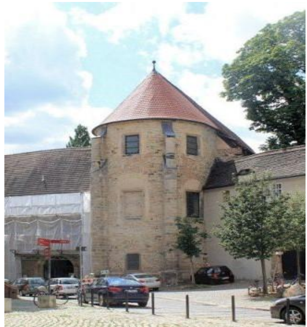
All Saints Chapel, Halle, Saxony-Anhalt, Germany